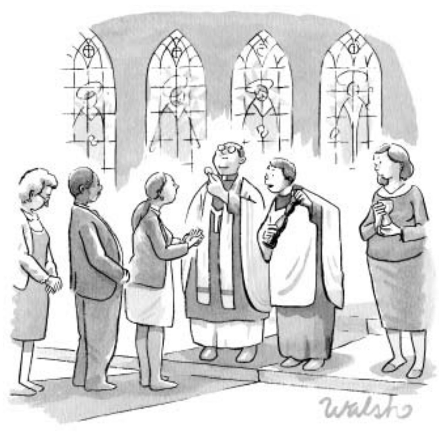
"Freshly ground pepper?"

rock star of women's-studies programs. Yet a wider public hungry for transgressive heroines (especially those who die tragically) has failed to embrace her.